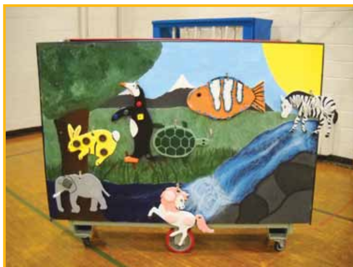
Mobile Sensory Board

The Commack High School students designed, created and built indoor portable play equipment (Play for All) for the preschool and school aged children at the Children's Center. The new, portable play equipment has something for everyone. The equipment includes a giant chime, sensory boards and personal tabletop Velcro play boards with various shaped, colored and textured pieces for our kids to play with.