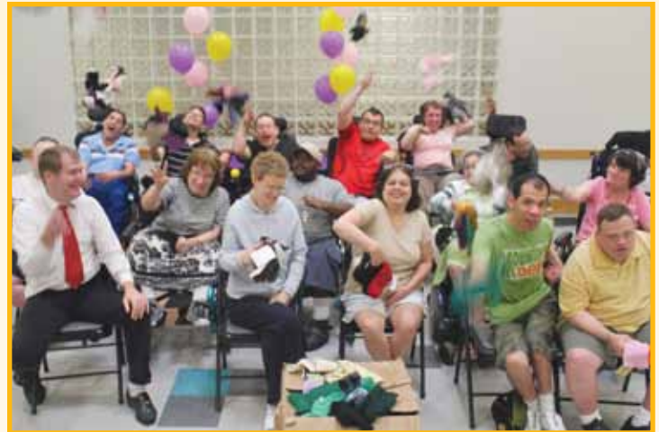
Adult Day Service Program Participants Enjoy Delivery of New Socks

Amongst the items UCP Suffolk has received from Fashion Delivers over the past two months are linens and towels for several of our residences, interview and work appropriate clothing for individuals served through The Employment Connection, hundreds of pairs of socks, and beautiful children's pajamas. We expect that this is just the beginning of a long and wonderful relationship.