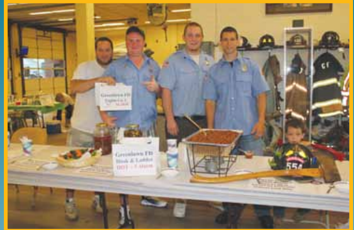
Winning Greenlawn Fire Department Teams

The Greenlawn Fire Department really got things stirred up when it hosted the first annual Chili Cook-Off to benefit United Cerebral Palsy Association of Suffolk, Inc. (UCP). All proceeds went to directly support the programs and services provided annually by UCP to almost 3,500 local individuals with disabilities and their families.