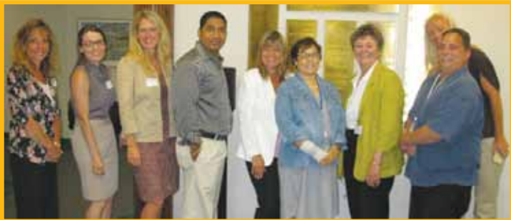
Representatives from Manpower (left) and The Employment Connection Staff

The Manpower professionals held mock interviews with individuals in UCP Suffolk’s job placement, supported employment and employment training areas, and met with those seeking employment whose difficulty obtaining jobs is compounded by the current economic climate. The job ready skills of the applicants included clerical, reception, customer service, stock, assembly, cashier, porter and childcare. Afterwards, participants were critiqued and had the chance to