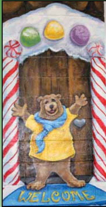
Children's Center Mascot, Honey Bear